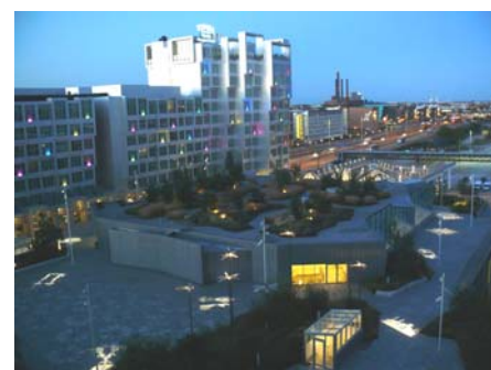
At nightfall the complex is illuminated by spotlights which project different light objects onto the roof surface. Hotel guests have a fascinating view from their rooms.