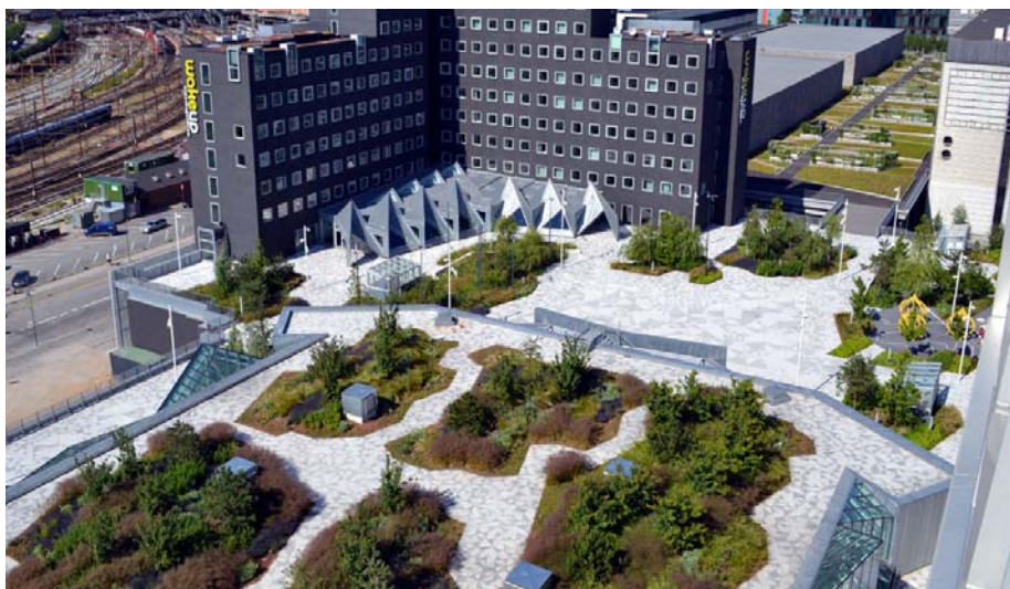
The roof of the Tivoli Congress Centre can be seen in the foreground while the upper right-hand corner shows the landscaped bridge to the Danish National Archives.