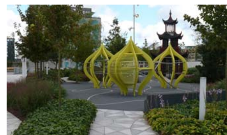
The design of the playground which was implemented on a protective rubber mat clearly shows an Asian influence.