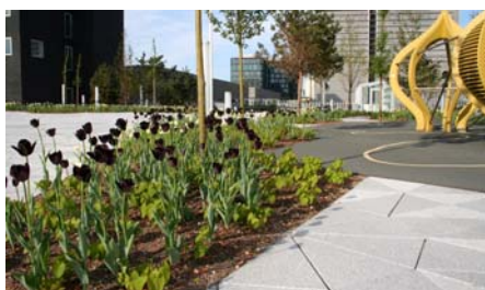
About 60.000 black and white tulips have been planted in the numerous planting beds.