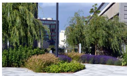
Lavender provides colourful accents within the grasses and shrubs.