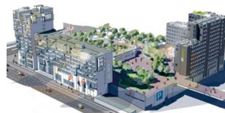
This rendering shows the roof of the Tivoli Congress Centre with the transition to the landscaped bridge of the Danish National Archives.

the entire roof surface on both roof levels, then it was filled with Zincolit® Plus and covered with the System Filter SF. The walkways around the planting beds and the playground were covered with Chinese granite, which was laid in a harlequin pattern. The planting beds were mainly planted with perennials and low-growing shrubs, but also with seasonal plants such as black and white tulips.